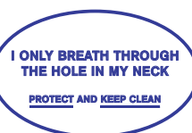
Hospital Emergency Decal

We also provide club listings from around the world and a comprehensive listing of dealers and manufacturers who specialize in supplies, products, and services for laryngectomees.