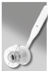
Indwelling Voice Prosthesis

other categories such as Stoma Care, Radiation, Treatment Side Effects, Travel, Activities and Everyday Living. Illustrations are provided to make them easier to understand.