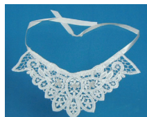
Fashion Stoma Cover

Included are two newsletters, Whispers on the Web and HeadLines, specializing in articles and education for the laryngectomee, plus links to other